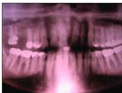
Figure 2: The DPT of the patient at presentation. The periapical radiolucency associated with the mesio-buccal and palatal roots may be seen