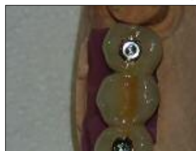
Figure 7: The implant-retained bridge