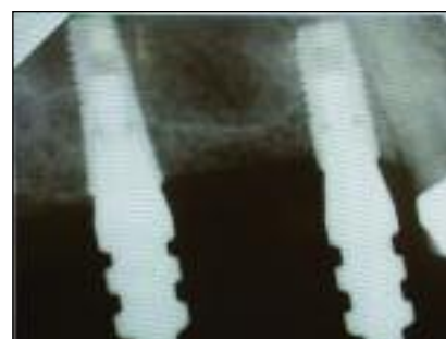
Figure 5: The impression copings in