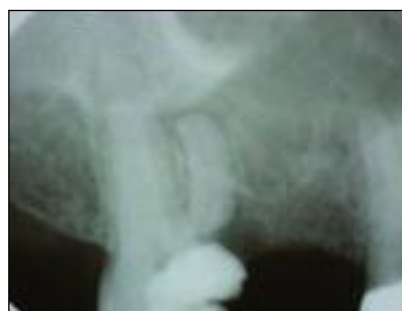
Figure 3: A digital periapical image of the upper right second molar and upper right second pre-molar, where the extent of the decay in the maxillary second molar is seen more clearly