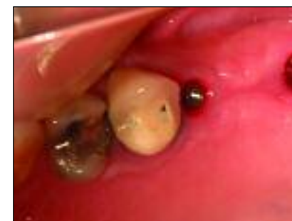
Figure 8: Two new uni-abutments were fitted

The patient was a 53-year-old male, a non smoker and with no significant medical history. He was an engineer by profession. He had lost his right first maxillary molar (RHS) around five years previously. Subsequently, he developed a large carious cavity in the maxillary second molar (RHS) and was referred to an endodontist for treatment. The endodontist felt this tooth would be unrestorable and advised that it be extracted. Faced with the prospect of a large gap in the posterior quadrant, the patient was referred to the practice in January 2005 for consultation regarding the upper right quadrant.