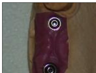
Figure 6: Uni-abutments were selected for construction of a screw-retained bridge